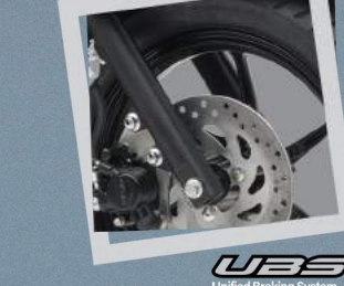
WITH DISC BRAKE & TELESCOPIC SUSPENSION