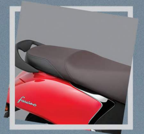
WIDE COMFORTABLE SEAT