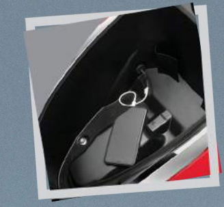
USB CHARGER (OPTIONAL)