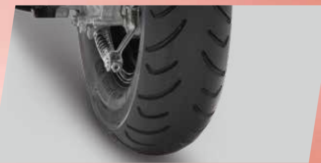
110MM WIDER REAR TYRE