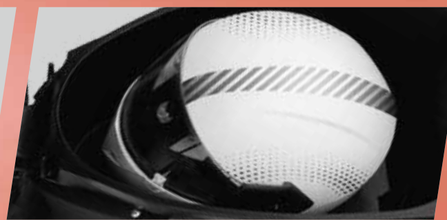
21 L LARGE UNDER-SEAT STORAGE