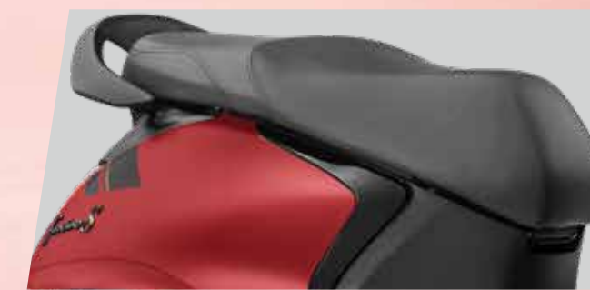
WIDE COMFORTABLE SEAT