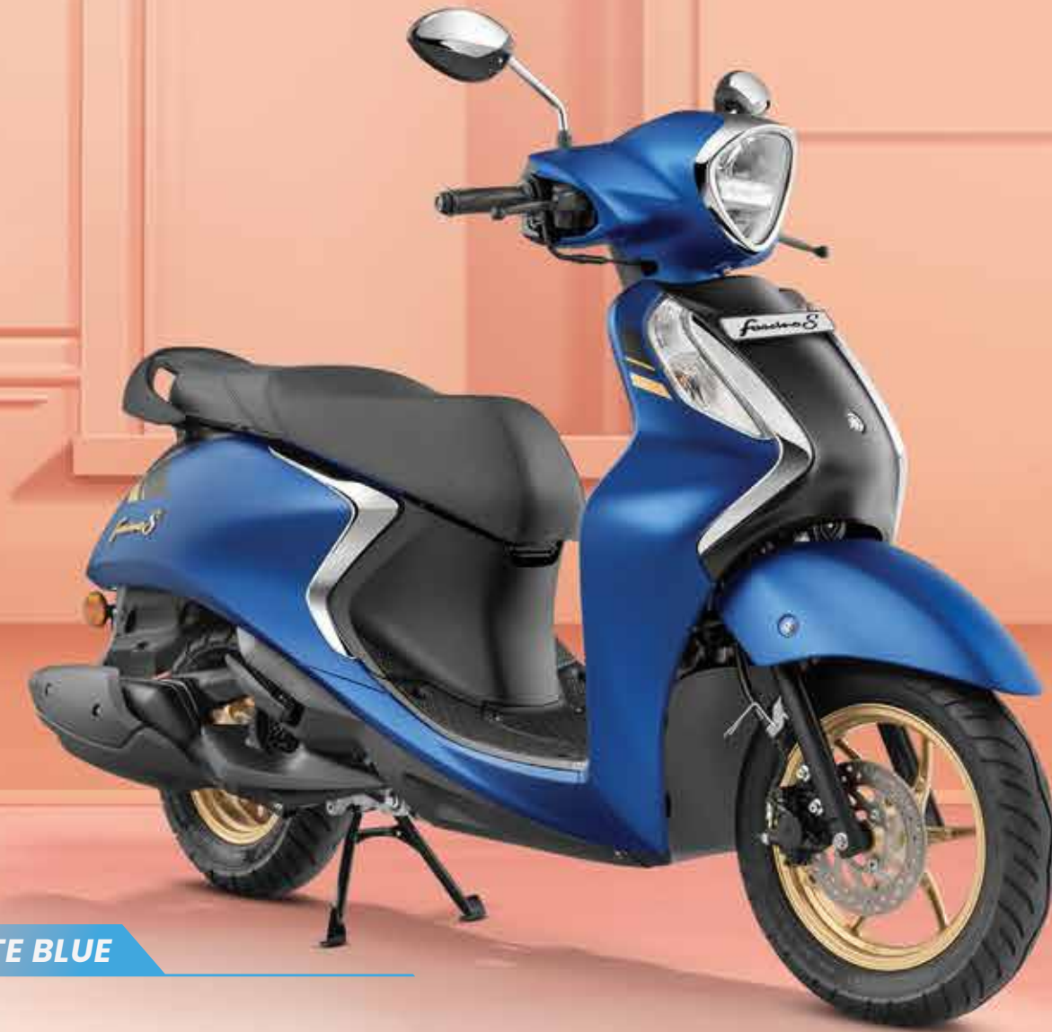
DARK MATTE BLUE