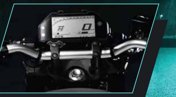
Advanced LCD meter console