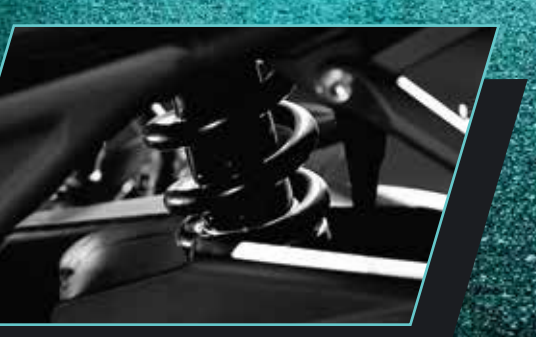
Long swingarm with optimal shock settings