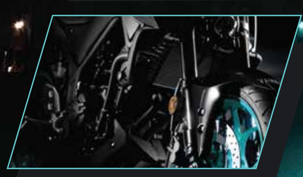
37mm upside down front forks