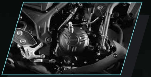
Torque-rich 321cc twin cylinder engine