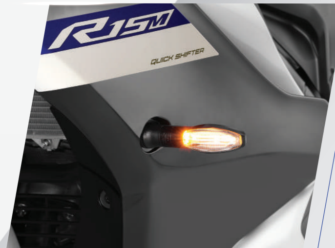
LED Flashers* (*Standard on R15M)