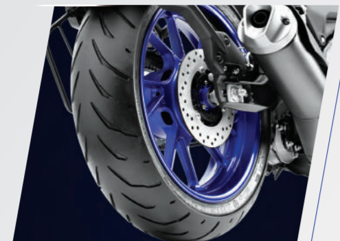
Super Wide 140 mm Radial Rear Tyre