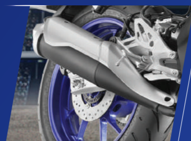
Grey Colour Muffer Guard*