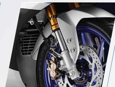
Upside Down Front Forks