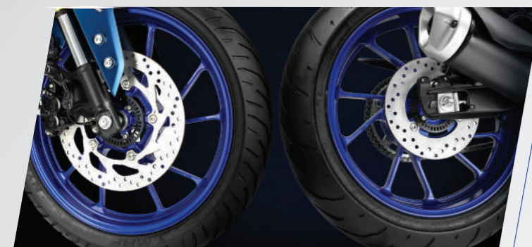
Dual Channel ABS