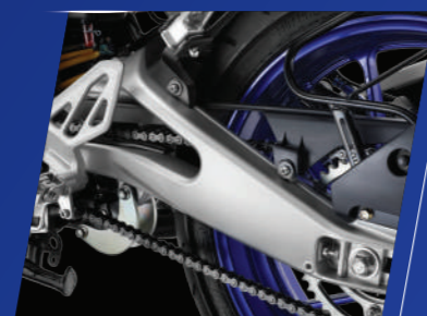
Grey Colour Aluminium Swingarm*